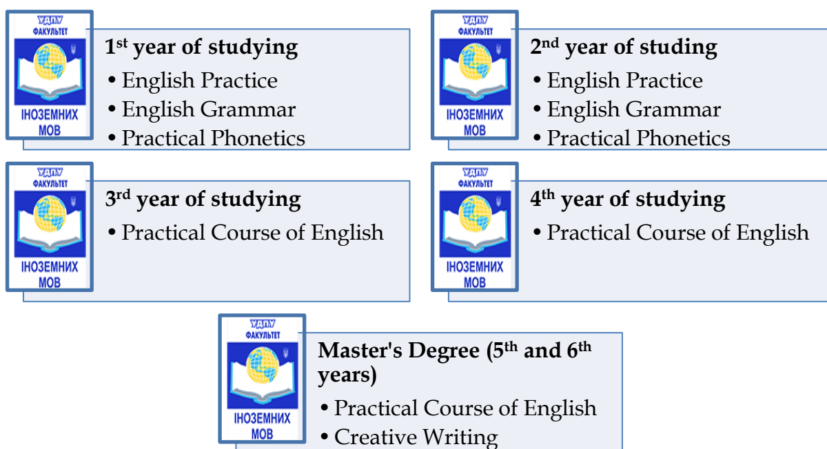
Figure 1. Compulsory Practical English Courses at Faculty of Foreign Languages of USPU

It is apparent from the analysis of methodological literature that most of tasks classifications take into account the gradual development of students' skills and abilities. This fact is clearly demonstrated in textbooks focused on learning a foreign language at secondary schools. We believe that such a sequence is difficult to note in the textbooks and manuals for teaching English at higher education (we analyse teaching aids and manuals at Faculty of Foreign Languages of USPU). This is explained by the specificities of teaching the main compulsory English practical disciplines at each level of studying (Fig. 1) and students' high level of English (this conclusion was made on the analysis of students' tests results at the end of each course).